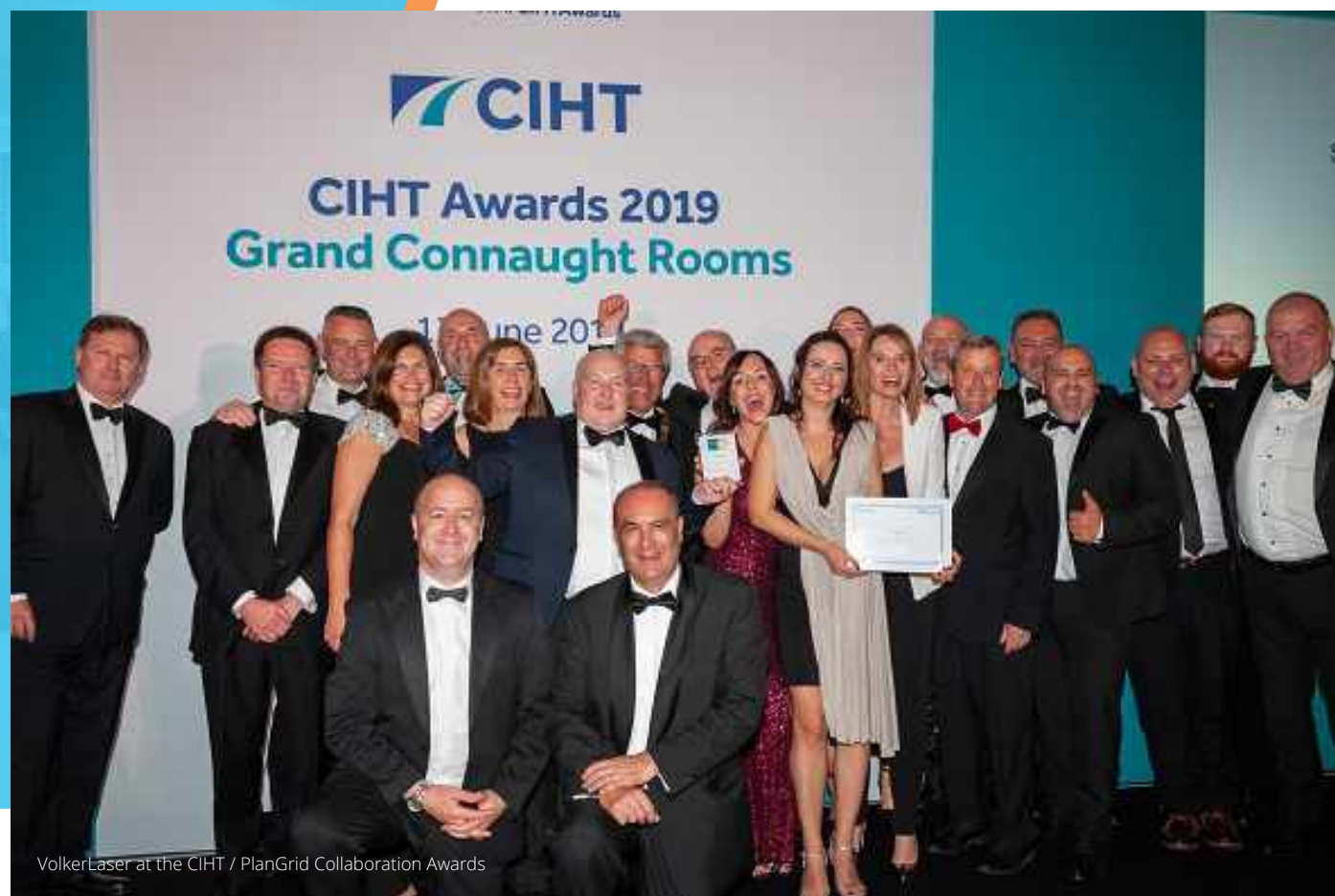
VolkerLaser at the CIHT / PlanGrid Collaboration Awards

VolkerWessels UK has always prided itself on operating in a fair and ethical manner. It is our desire to work alongside a network of like-minded supply chain partners, that we can learn from and work with collaboratively.