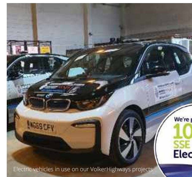
Electric vehicles in use on our VolkerHighways projects

main offices and long-term projects now have gas and electricity being supplied from 100% renewable energy sources. Based on 2019 consumption, this equates to 41% of our electricity supply and 85% of our gas supply.