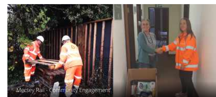
Mersey Rail - Community Engagement