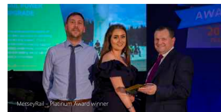
MerseyRail – Platinum Award winner