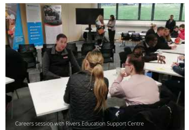
Careers session with Rivers Education Support Centre

Hoddesdon head office, to dispel some of these myths. One of the most impactful events held was a careers session, where students met with a variety of employees from VolkerWessels UK and local company MCP Property Services Ltd. Students could ask questions about what the employees did, what they enjoyed most and disliked about their job, as well as learning about the breadth of opportunities a career in construction can bring. It was a hugely successful event, and one that will form the blueprint of more to come in the future.