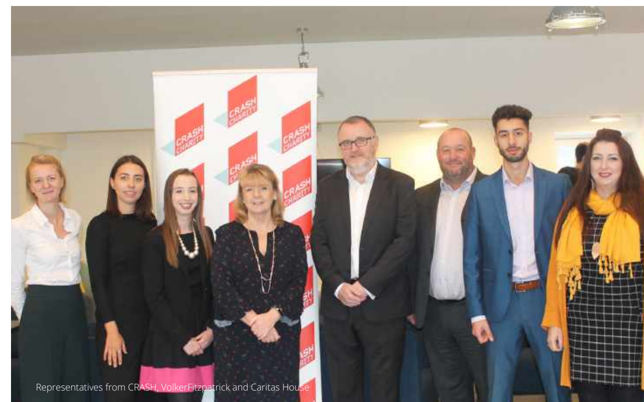
Representatives from CRASH, VolkerFitzpatrick and Caritas House