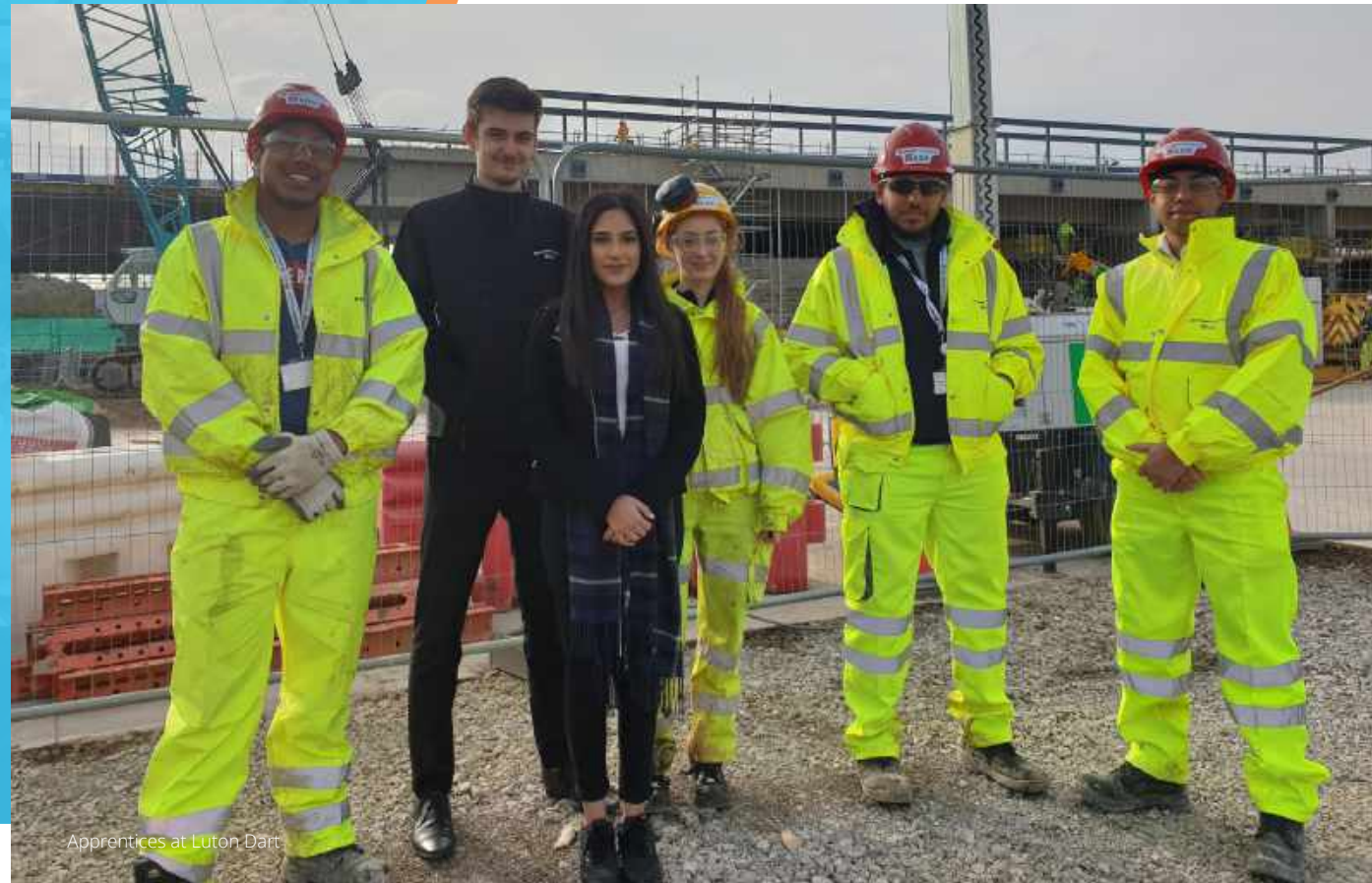
Apprentices at Luton Dart

We're a people-first kind of business, and we recognise that our success is built upon the contributions of our industry talent. In the face of a skills shortage across the construction industry it is increasingly important that we have a clear focus on both current and future employees. Our education engagement and employability programmes are key to this.