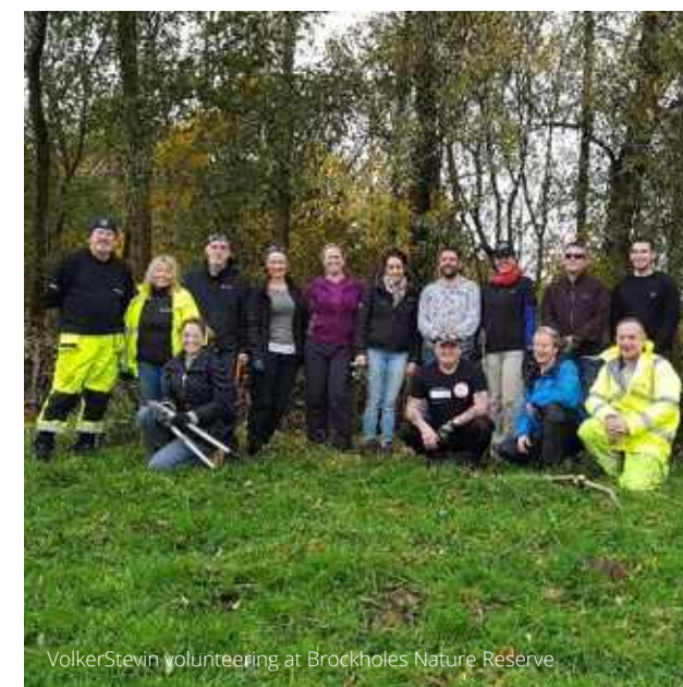
VolkerStevin volunteering at Brockholes Nature Reserve

Players have commented that the game is both enjoyable and informative, stating as a learning experience that they felt more confident in trying to answer questions as a team, rather than being singled out on a training course.